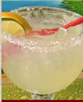
LIME MARGARITA ON THE ROCKS