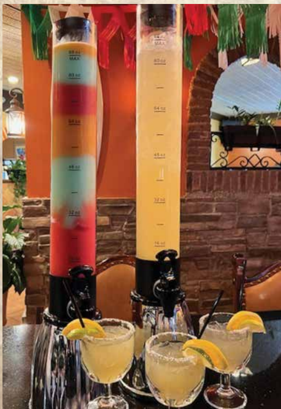
MARGARITA TOWERS . . . . .

An upside-down Corona beer in our house lime margarita, frozen or on the rocks. 14.99