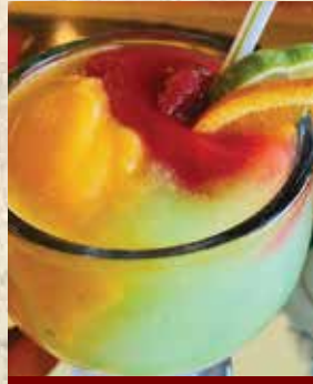
RAINBOW MARGARITA . . .