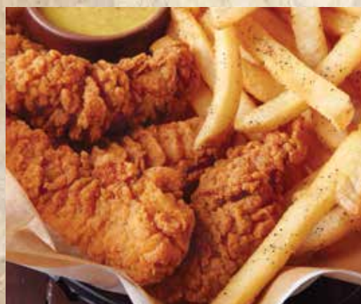
CHICKEN TENDERS & FRIES

Grilled chicken strips over rice, all topped with cheese sauce.