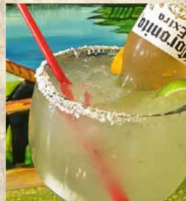
MARGARONA . . . . .

Margaritaville Tequila and coconut blended with pineapple juice and crème de coconut. 12.99