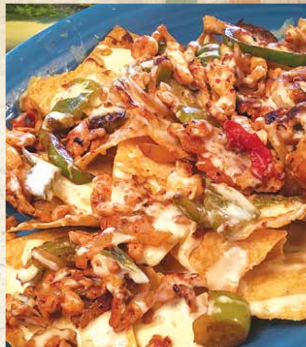
CHICKEN NACHOS FAJITA

Choice of grilled chicken or steak, fajita vegetables and melted cheese piled on fresh homemade taco chips. 14.99