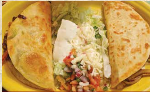
QUESADILLAS DE FAJITAS