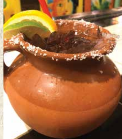
FIESTA CHARRA MARGARITA . . . . .

HOUSE TEQUILA - 6.99 We use Gold Tequila to make our margaritas