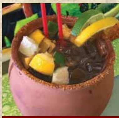
CANTARITO • • • •

Served in a clay pot traditionally named cantarito (most popular margarita in Mexican festivals). Tequila, lime, orange, grapefruit juice, splash of grapefruit soda. Served with salt and tajin on the rim