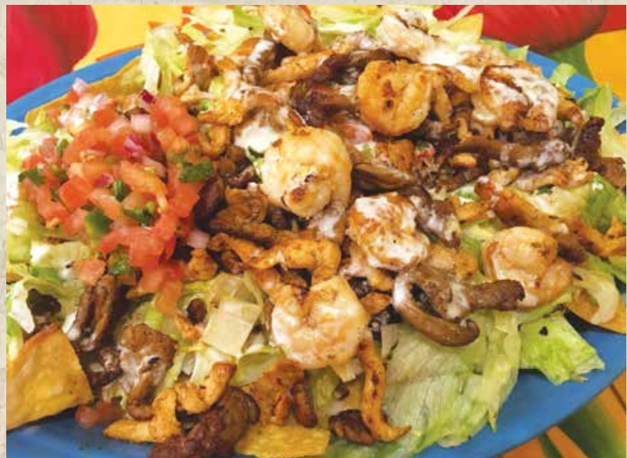
NACHOS AL CARBON

Choice of grilled chicken or steak with grilled onions, melted cheese and a soft flour tortilla. Served with rice, beans and salad. 15.99