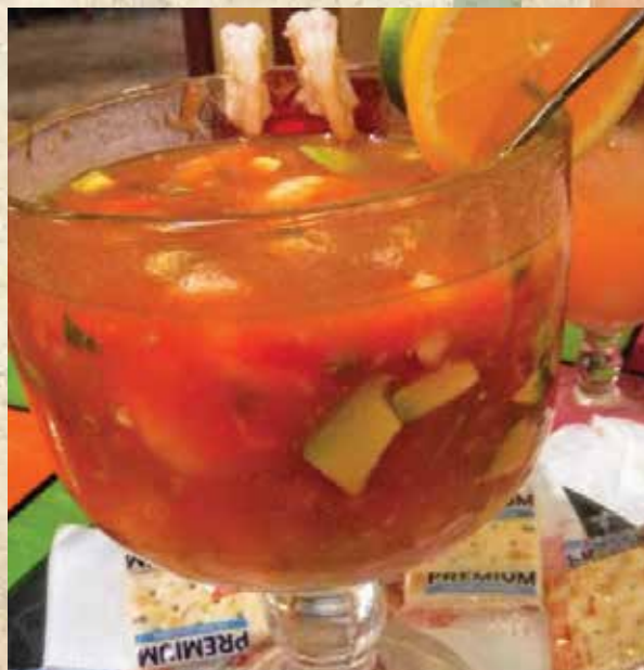
COCTEL DE CAMARONES