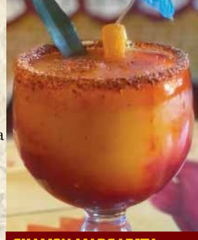
CHAMOY MARGARITA . . . . .