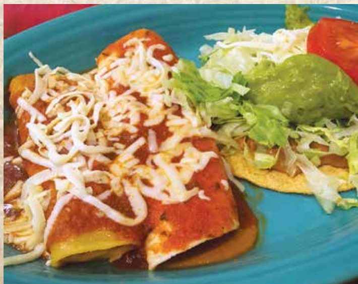
VEGGIE PLATE D