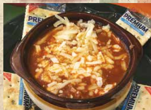
MEXICAN CHILI WITH BEANS