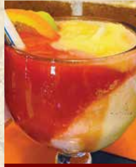
TROPICAL MARGARITA . . .