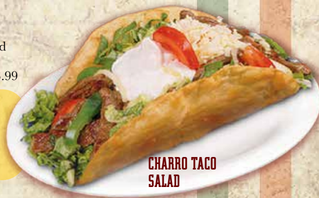
CHARRO TACO SALAD