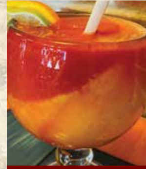
CARIBE MARGARITA . . . . .